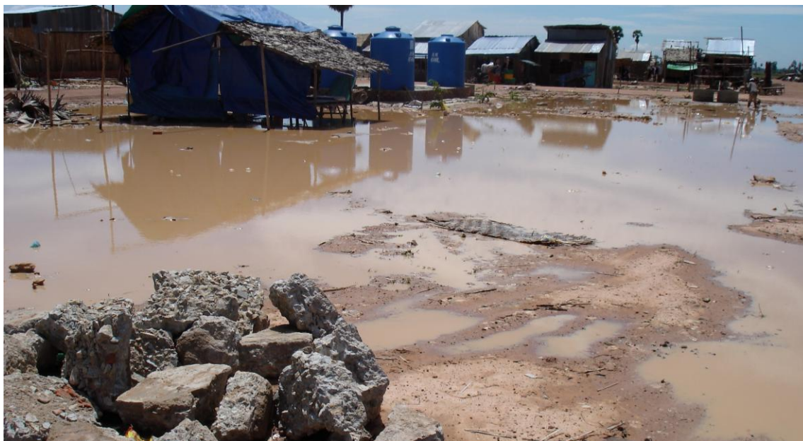
Figure 3: June 2006: residents from the Bassac riverfront area in Phnom Penh were forcibly evicted to this site over 20 kms outside the city. It was the start of the rainy season and virtually no infrastructure was in place (see image).

For those who were renting at Bassac a site nearby at Phum Andong was established which had no plot boundaries. Over 1,500 families flooded into the site where severe conditions remain to this day