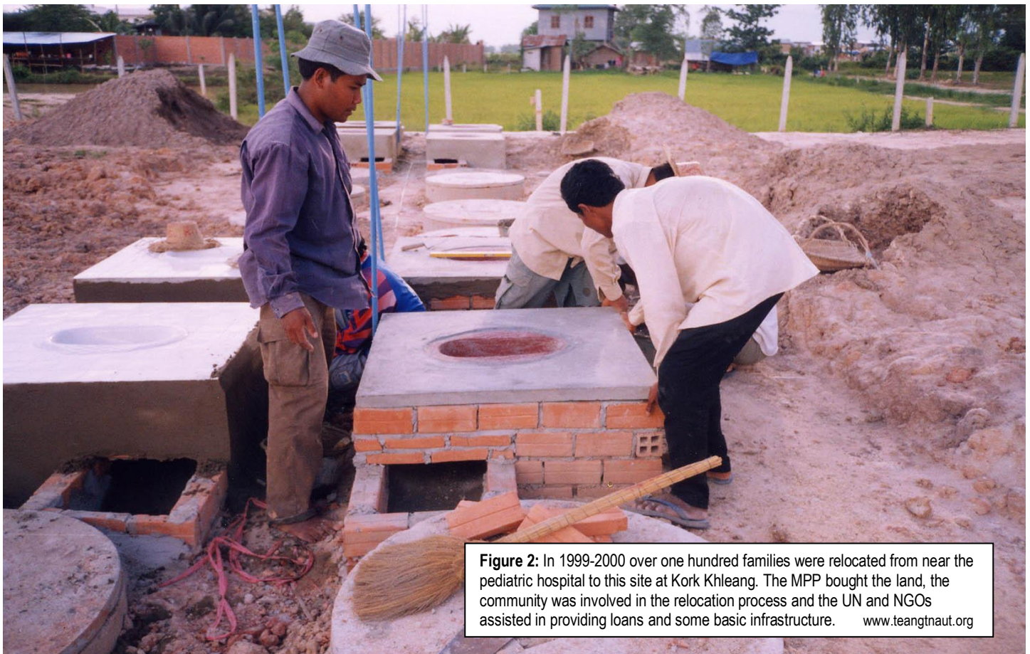
Figure 2: In 1999-2000 over one hundred families were relocated from near the pediatric hospital to this site at Kork Khleang. The MPP bought the land, the community was involved in the relocation process and the UN and NGOs assisted in providing loans and some basic infrastructure. www.teangtnaut.org