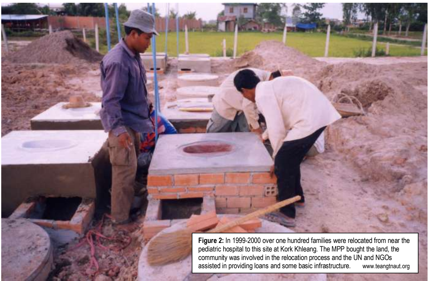
Figure 2: In 1999-2000 over one hundred families were relocated from near the pediatric hospital to this site at Kork Khleang. The MPP bought the land, the community was involved in the relocation process and the UN and NGOs assisted in providing loans and some basic infrastructure. www.teangnaut.org