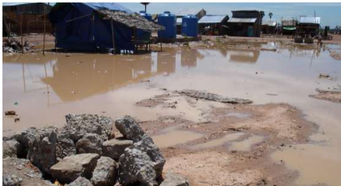
Figure 3: residents from the Bassac riverfront area in Phnom Penh were forcibly evicted to this site over 20 kms outside the city. It was the start of the rainy season and virtually no infrastructure was in place (see image).

For those who were renting at Bassac a site nearby at Phum Andong was established which did not even have plot boundaries. Over 1,500 families flooded into the site where dire conditions remain to this day